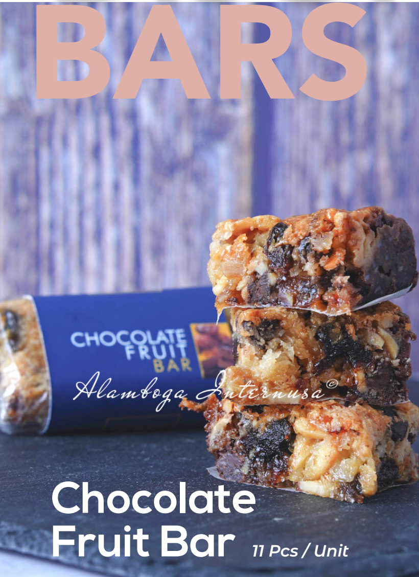
Chocolate Fruit Bar 11 Pcs / Unit

A true original from the good old days, this bar is still a winner. Made from coconut, dried fruit, condensed milk, and dark chocolate, this is not for those watching their waistlines, but oh so nice!