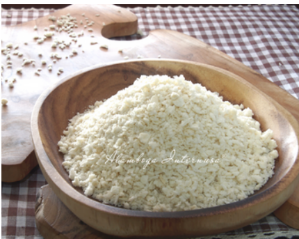
White Bread Crumbs 3 x 1 Kg & 10 Kg