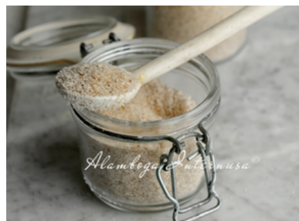
Psyllium Husk 95% 3 x 1 Kg & 15 Kg