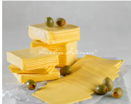
Dairymont - Coloured Cheddar Cheese Burger Sliced | 84's 1 Kg