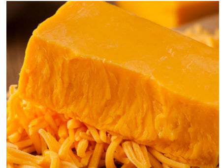
Red Cheddar Cheese Kg