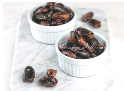
Pitted Dates 3 x 1 Kg & 10 Kg