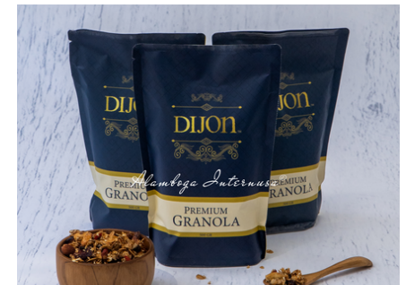
Dijon - Premium Granola 3 x 500 Gr