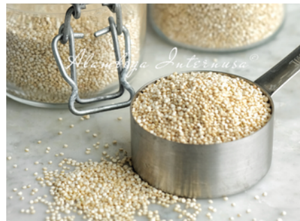
Organic White Quinoa 3 x 1 Kg & 25 Kg