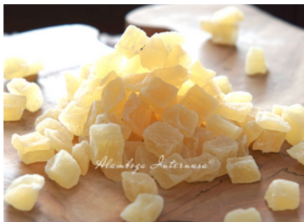
Diced Pineapple 20 Kg