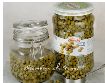
Novella - Capers Lacrimella in Wine Vinegar | 6 x 1,600 ML | Glass Jar