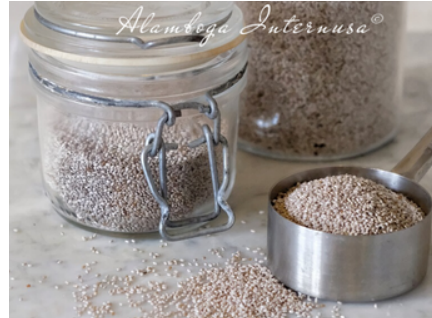
Organic White Chia Seeds 3 x 1 Kg & 25 Kg