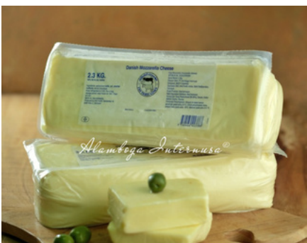
Mozzarella Cheese Block 2.3 Kg & 8 x 2.3 Kg