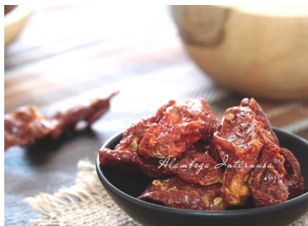
Sundried Tomatoes 3 x 1 Kg & 10 Kg