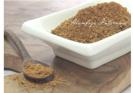
Cajun Spice Mix 3 x 500 Gr & 15 Kg