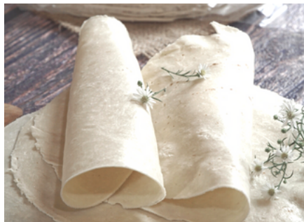
Tortillas Flour 11 Inch 20s