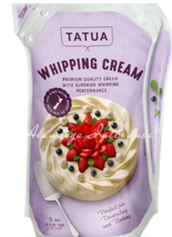
Tatua - Whipping Cream 36% For PASTRY | 1 Ltr, 12 x 1 Ltr