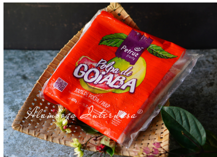
Frozen Guava Puree 400 Gr