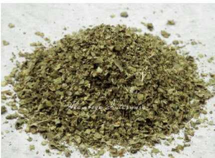
Marjoram Flakes 10 Kg