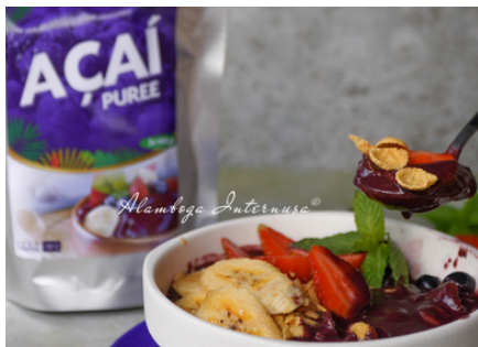
Frozen Acai Berries Puree 5 Kg