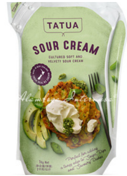
Tatua - Pouch SOUR CREAM 1 Ltr, 12 x 1 Ltr