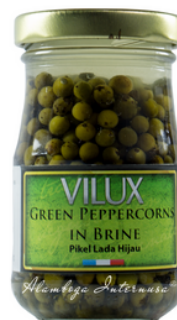
Vilux - Green Peppercorns in Brine 6 x 60 Gr | Glass Jar