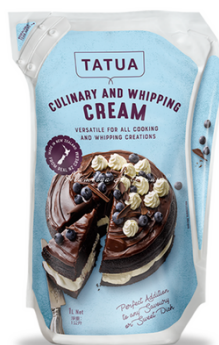
Tatua - Whipping Cooking Cream CULINARY | 1 Ltr, 12 x 1 Ltr