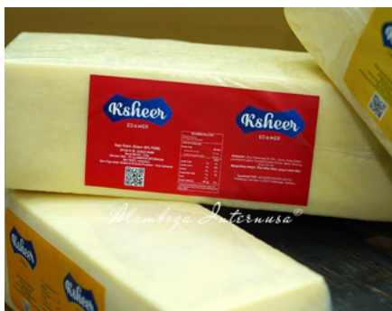
KSHEER - Edam Cheese 2.5 - 3.5 Kg