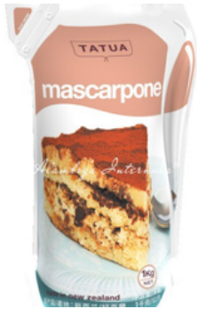
Tatua - Pouch MASCARPONE Cheese | 1 Kg, 12 x 1 Kg