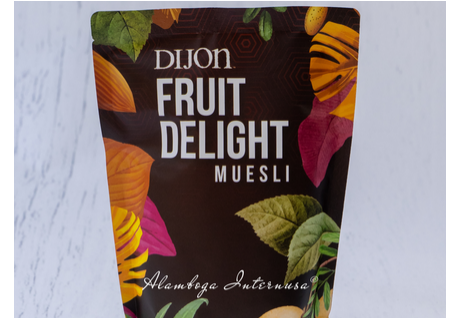
Dijon - Fruit Delight Muesli 3 x 750 Gr