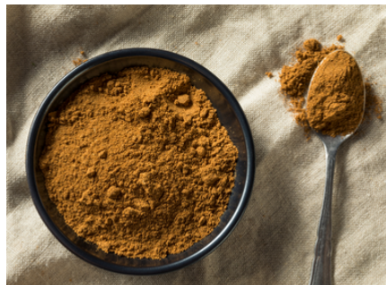
Chinese Five Spice 3 x 500 Gr