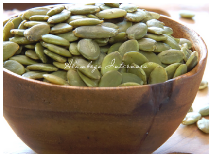
Pumpkin Seeds 3 x 1 Kg & 25 Kg