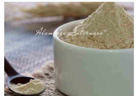
Organic Maca Powder 3 x 1 Kg & 20 Kg