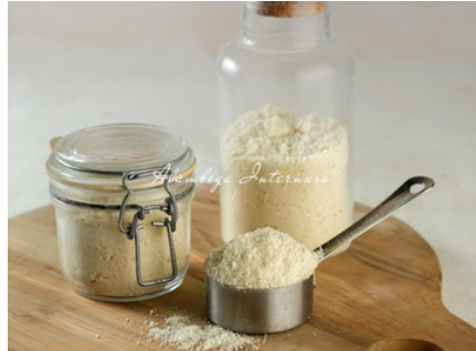
Almond Flour Extra Fine 3 x 1 Kg & 11.34 Kg