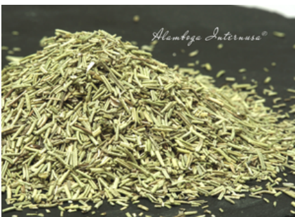
Dried Rosemary Cut 3 x 350 Gr & 10 Kg