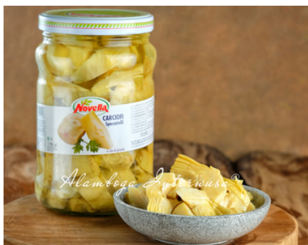
Novella - Splitted Artichokes in Oil | 6 x 1,550 ML | Glass Jar