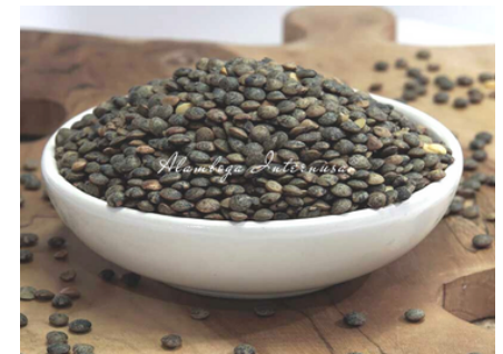
Du Puy Lentils 3 x 1 Kg & 25 Kg