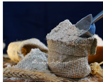
Buckwheat Flour 3 x 1 Kg & 25 Kg