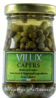
Vilux - Capers Les Epices 6 x 60 Gr | Glass Jar