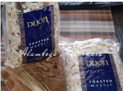
Dijon - Toasted Muesli 3 x 750 Gr