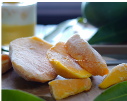
IQF Mango 3 x 1 Kg