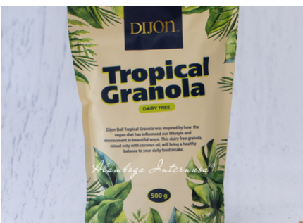
Dijon - Dairy Free Tropical Granola | 3 x 500 Gr