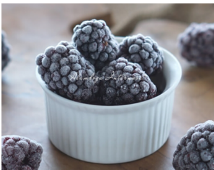
IQF Blackberries 3 x 1 Kg & 10 Kg