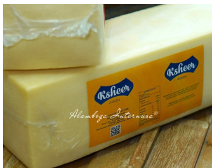
KSHEER - Gouda Cheese 2.5 - 3.5 Kg