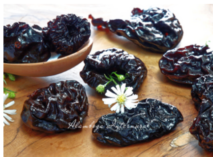
Pitted Prunes 3 x 1 Kg & 10 Kg