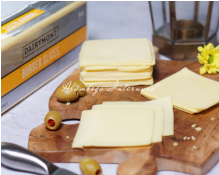
Dairymont - White Cheddar Cheese Burger Sliced | 84's 1 Kg