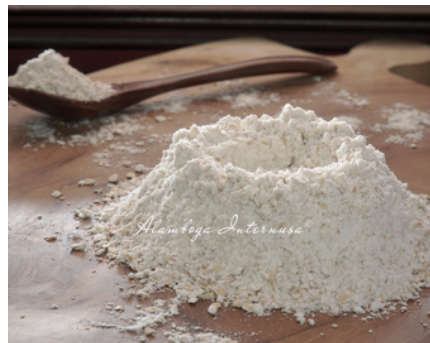
Wholemeal Flour 3 x 1 Kg & 12.5 Kg