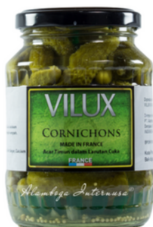
Vilux - Cornichons 6 x 350 Gr | Glass Jar