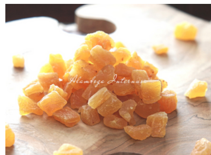
Diced Apricots 12.5 Kg