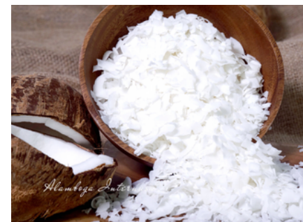
Coconut Flakes 3 x 1 Kg & 11.34 Kg