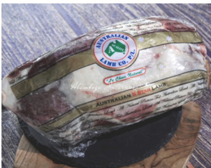
Boneless Lamb Oyster Cut Shoulder | 1,3 - 2 Kg