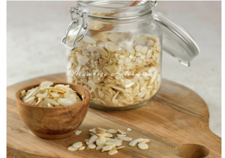
Blanched Sliced Almonds 3 x 1 Kg & 11.34 Kg