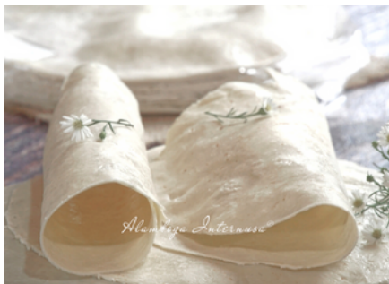
Tortillas Flour 8 Inch 10s