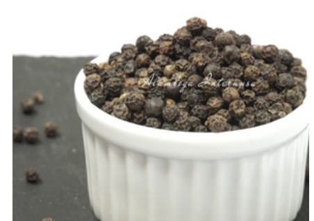
Black Peppercorns 3 x 500 Gr, 5 Kg & 25 Kg