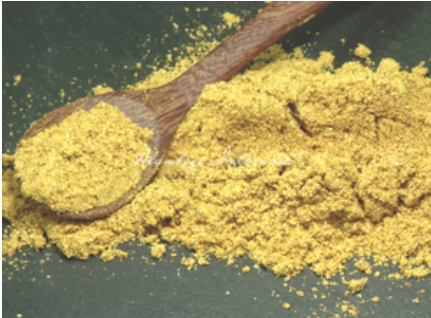
Mild Curry Powder 3 x 500 Gr & 25 Kg