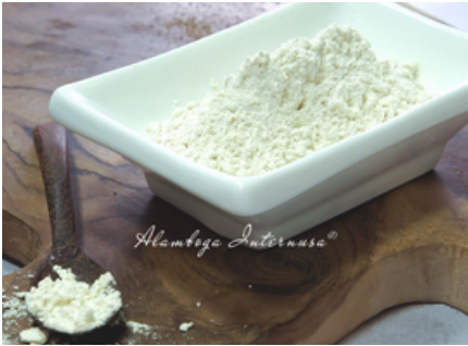
Onion Powder 3 x 500 Gr & 25 Kg