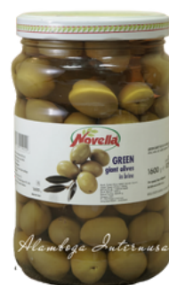
Novella - Green (Giant) Olives in Brine 6 x 1,600 ML | Glass Jar