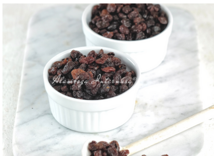
Dried Raisins 3 x 1 Kg & 11.34 Kg