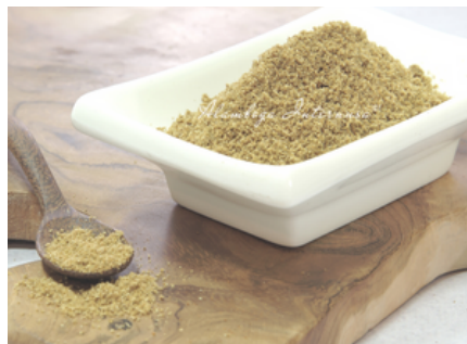
Cumin Ground 3 x 500 Gr & 25 Kg