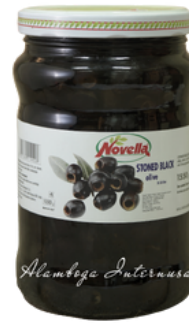
Novella - Stoned (Pitted) Black Olives in Brine 6 x 1,550 ML | Glass Jar