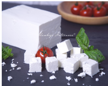
Danish White Cheese (Feta) 1 Kg