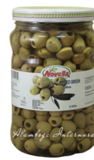
Novella - Pitted Green Olives in Brine 6 x 1,550 ML | Glass Jar