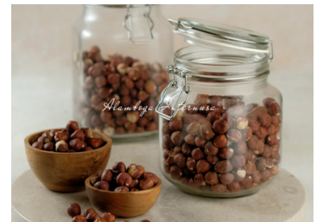
Hazelnuts (Size 13-15 mm) 3 x 1 Kg & 25 Kg