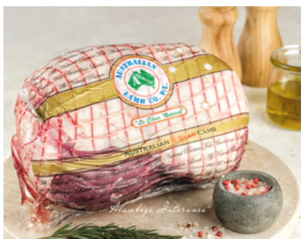
Boneless Lamb Leg 1,7 - 2,7 Kg