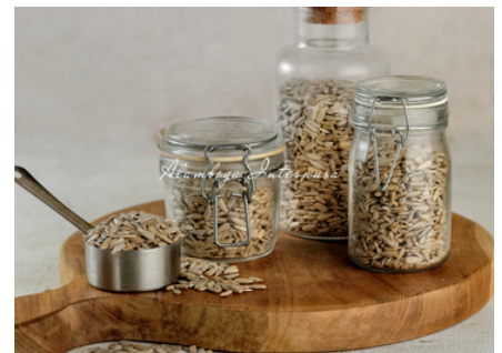
Sunflower Seeds 3 x 1 Kg & 25 Kg