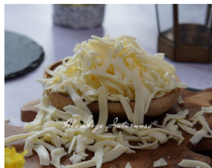
Shredded Mozzarella Cheese 2.3 Kg