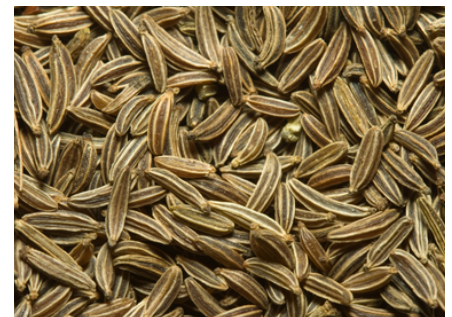
Cumin Seeds 3 x 500 Gr & 5 Kg