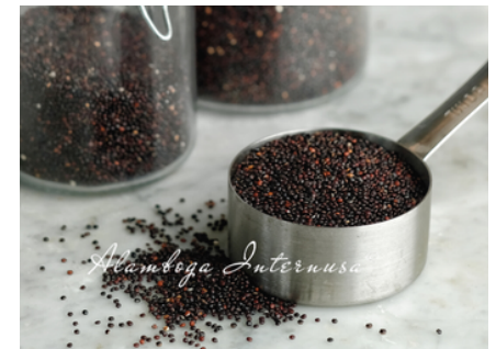
Organic Black Quinoa 3 x 1 Kg & 25 Kg