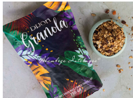
Dijon - Granola 3 x 750 Gr