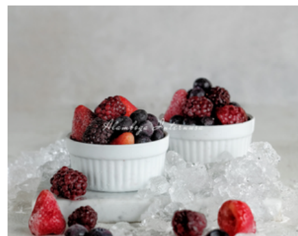
IQF Mixed Berries 3 x 1 Kg & 10 Kg