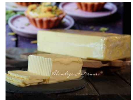
LURMARK - Lactic Unsalted Butter | Kg & 25 Kg