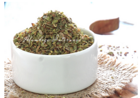
Oregano Flakes 3 x 200 Gr & 10 Kg