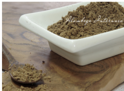
Garam Masala 3 x 500 Gr