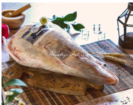
Bone-In Lamb Leg Chump Off 2,3 - 3 Kg