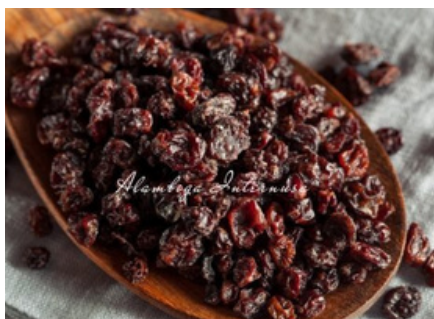
Dried Currants 3 x 1 Kg & 12.5 Kg