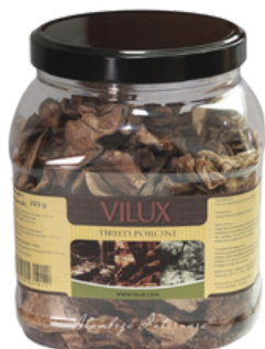
Vilux - Dried Porcini Mushrooms 225 Gr | Plastic Jar