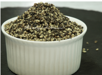
Cracked Black Pepper 3 x 500 Gr