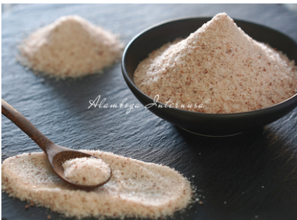
Himalayan Pink Salt 1 Kg