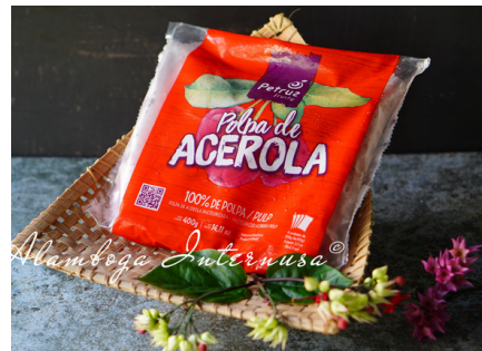
Frozen Acerola Puree 400 Gr