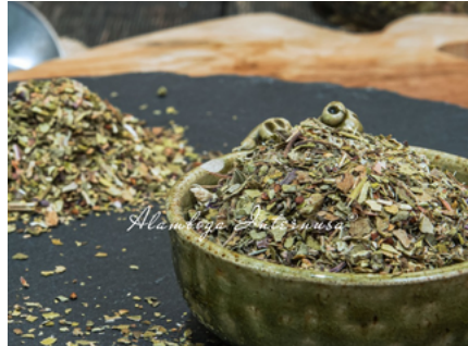
Dried Basil Leaves 3 x 150 Gr & 10 Kg