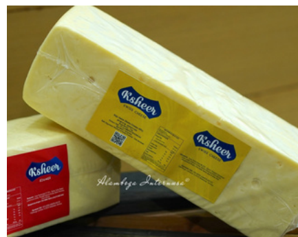
KSHEER - Swiss / Emmenthal Cheese 2.5- 3.5 Kg