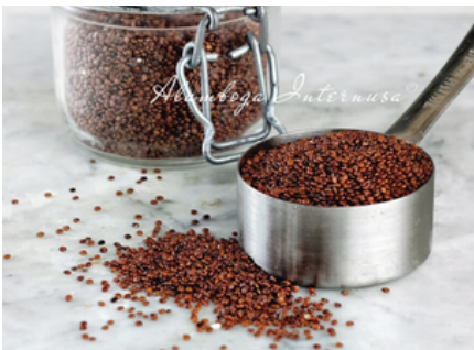
Organic Red Quinoa 3 x 1 Kg & 25 Kg