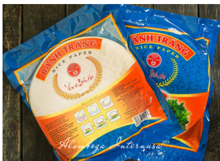
Banh Trang - Rice Paper 400 Gr