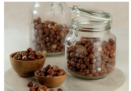
Blanched Hazelnut Kernels Roasted (Size 13- 15mm) 3 x 1 Kg & 12.5 Kg