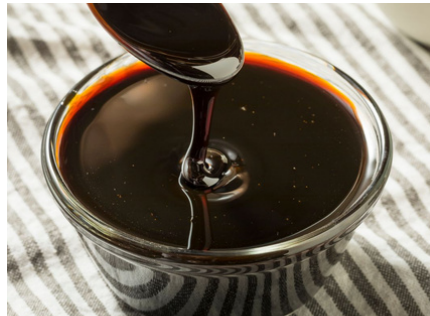
Molasses Syrup 1 Kg