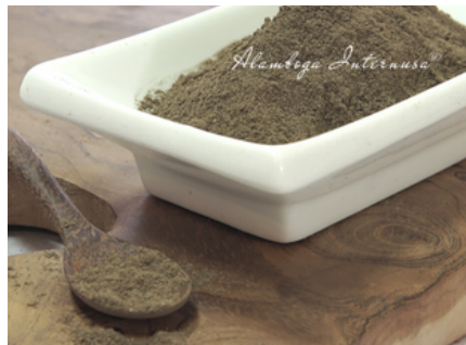
Black Pepper Ground 3 x 500 Gr & 25 Kg