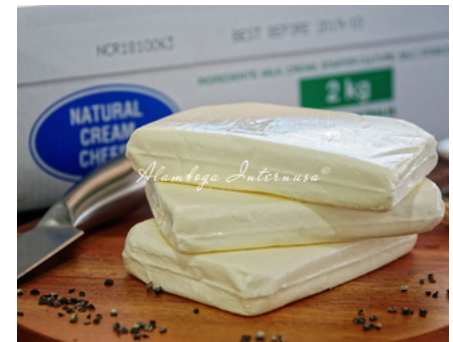
MG - Cream Cheese 10 Kg