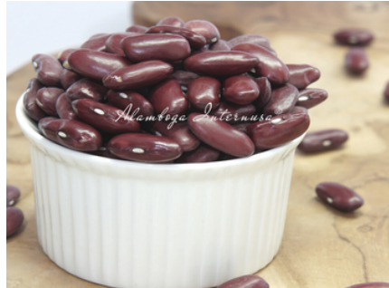
Red Kidney Beans 3 x 1 Kg & 25 Kg