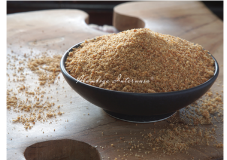
Coconut Palm Sugar Powder 3 x 1 Kg