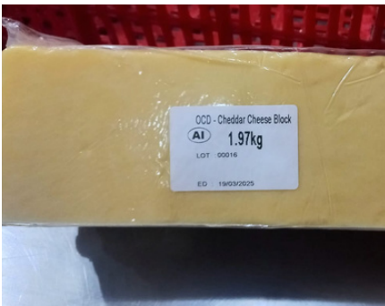
Cheddar Cheese Block Kg