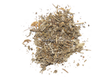
Sage Leaves 3 x 200 Gr & 10 Kg