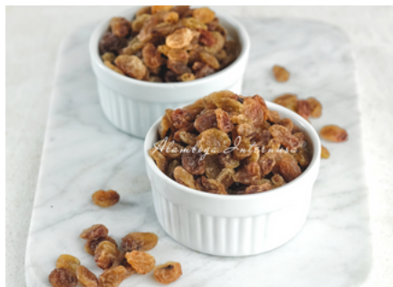
Dried Sultana 3 x 1 Kg & 10 Kg