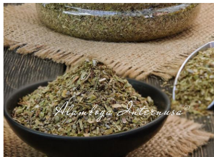
Mixed Herbs 3 x 200 Gr