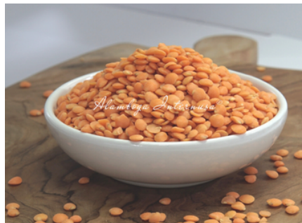
Whole Red Lentils 3 x 1 Kg & 25 Kg