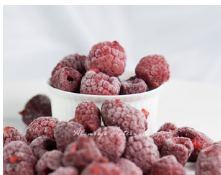
IQF Raspberries 3 x 1 Kg & 4 x 2.5kg