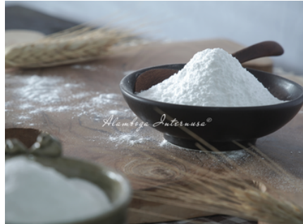
Icing Sugar 3 x 1 Kg