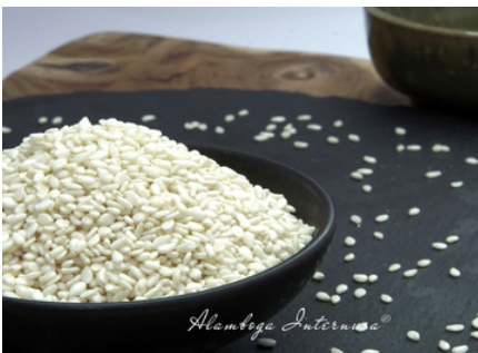
White Sesame Seeds 3 x 500 Gr & 3x1 Kg