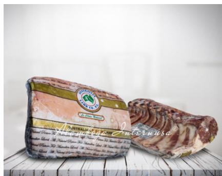
Bone-In Lamb Rack CFO 900 gr - 1 Kg