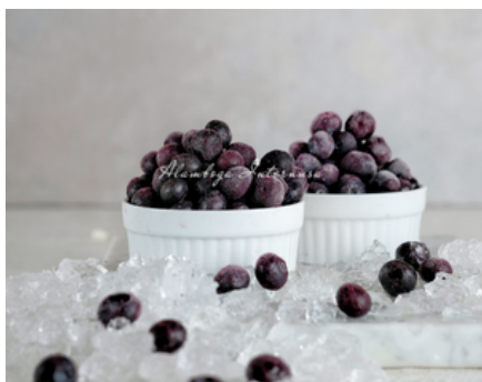
IQF - Blueberries 3 x 1 Kg & 13.6 Kg