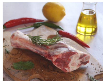
Bone-In Lamb Foreshank 400 - 500 Gr