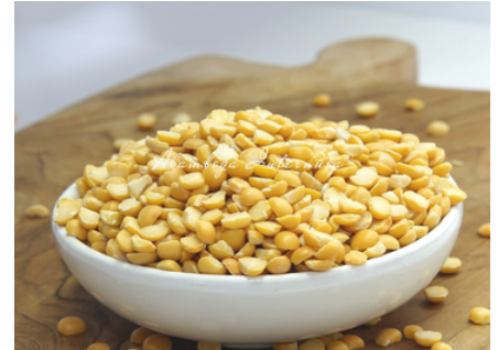
Yellow Split Peas 3 x 1 Kg & 25 Kg