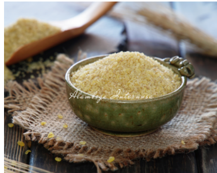
Burghul Fine 3 x 1 Kg & 25 Kg