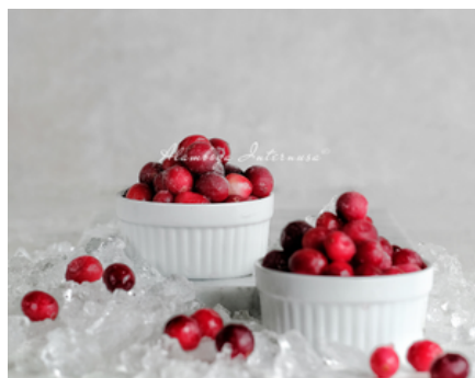
IQF - Cranberries 3 x 1 Kg & 18.14 Kg