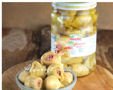
Novella - Artichokes (Whole) in Oil | 6 x 1,550 ML | Glass Jar