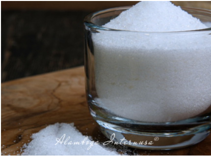
Caster Sugar 3 x 1 Kg & 5 Kg