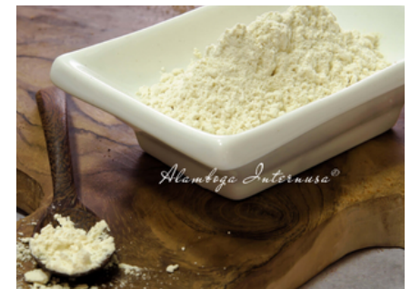
Garlic Powder 3 x 500 Gr & 25 Kg