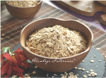
Rolled Oats 3 x 1 Kg & 25 Kg