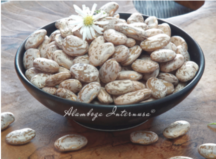
Pinto Beans 3 x 1 Kg & 25 Kg