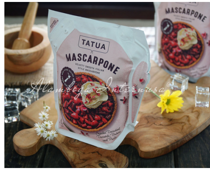
Tatua - Pouch Mascarpone Cheese | 6 x 500 gr