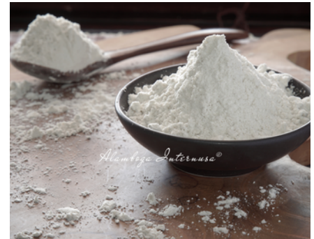
Self Raising Flour 3 x 1 Kg & 10 Kg