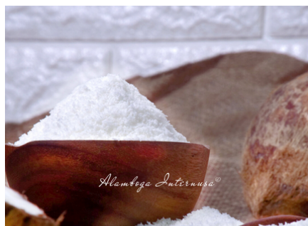
Desiccated Coconut 3 x 1 Kg & 25 Kg