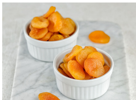
Dried Apricots 3 x 1 Kg & 12.5 Kg