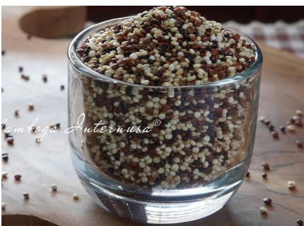
Organic Tricolour Quinoa 3 x 1 Kg & 25 Kg