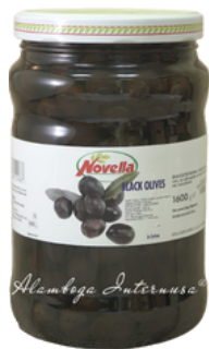
Novella - Black Olives (Whole) in Brine 6 x 1,600 ML | Glass Jar