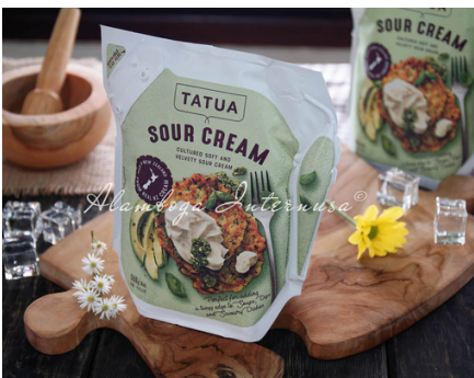
Tatua - Pouch Sour Cream 6 x 500 gr