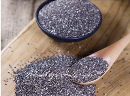
Organic Black Chia Seeds 3 x 1 Kg & 25 Kg