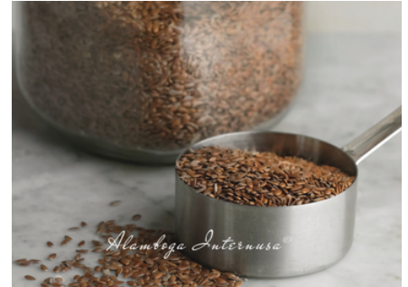
Flaxseed Linseed 3 x 1 Kg, 20 Kg & 25 Kg