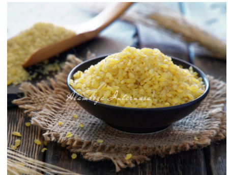
Burghul Coarse 3 x 1 Kg & 25 Kg