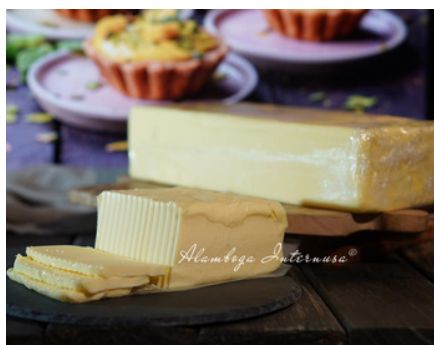
KSHEER - Lactic Unsalted Butter 25 Kg