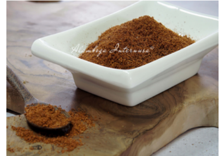
Cayenne Pepper 3 x 500 Gr, 2.5 Kg & 25 Kg