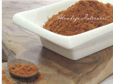
Sweet Paprika Ground 3 x 500 Gr, 2.5 kg & 25 Kg