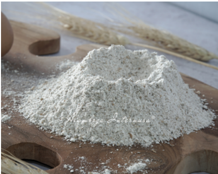
Organic Rye Flour 3 x 1 Kg & 25 Kg