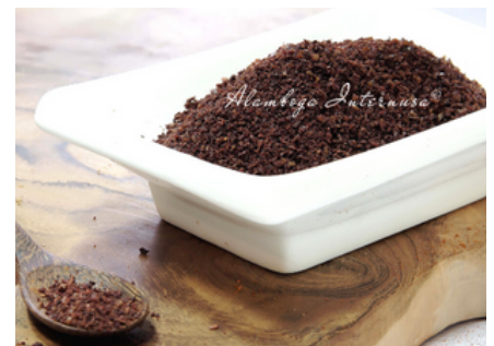
Sumac Powder 3 x 500 Gr & 25 Kg