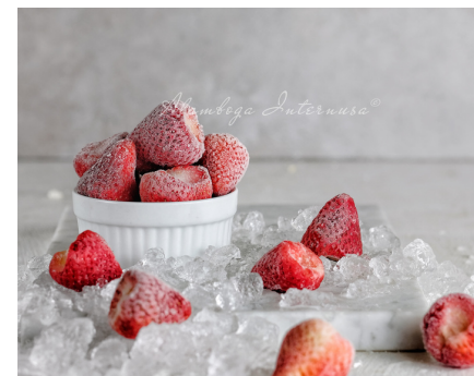
IQF Strawberries 3 x 1 Kg & 10 Kg