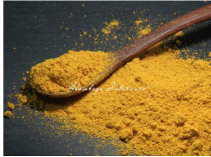
Turmeric Powder 3 x 500 Gr