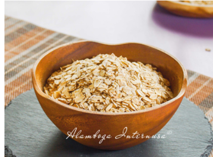
Honey Oats 3 x 1 Kg