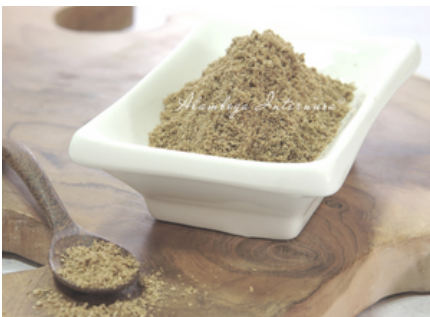
Coriander Ground 3 x 500 Gr & 5 Kg