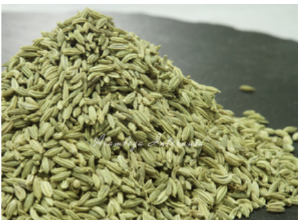
Fennel Seeds 3 x 400 Gr & 25 Kg