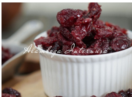
Dried Cranberries 3 x 1 Kg & 11.34 Kg