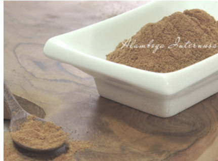
Cinnamon Ground 3 x 500 Gr & 5 Kg