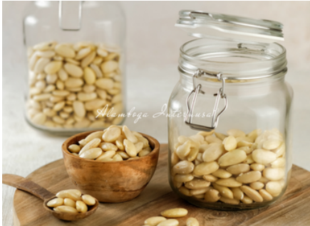
Blanched Whole Almonds 3 x 1 Kg & 11.34 Kg