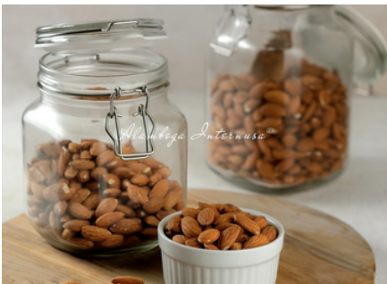
Whole Natural Almonds 3 x 1 Kg & 11.34 Kg