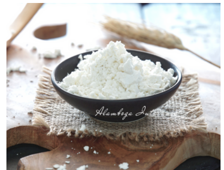
GF White Flour 3 x 1 Kg & 12.5 Kg