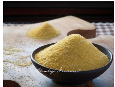
Polenta Coarse 3 x 1 Kg, 20 Kg & 25 Kg