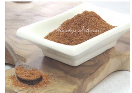
Hot Chili Powder 3 x 500 Gr, 2.5 Kg & 25 Kg