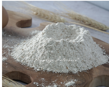
Rye Meal Flour 3 x 1 Kg & 12.5 Kg