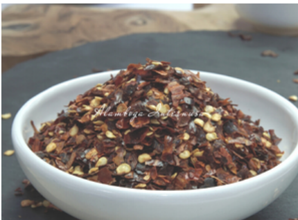
Chili Crushed 3 x 350 Gr, 2.5 Kg, 5 Kg & 25 Kg