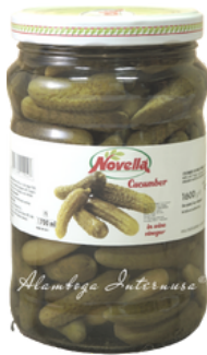
Novella - Cucumber (Gherkins) in Wine Vinegar 6 x 1,600 ML | Glass Jar