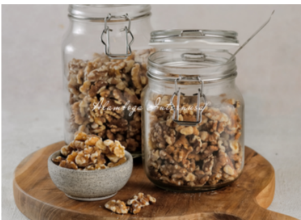
Walnut Halves Grade A 3 x 1 Kg & 10 Kg