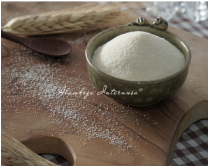
Fine Semolina Flour 3 x 1 Kg & 12.5 Kg