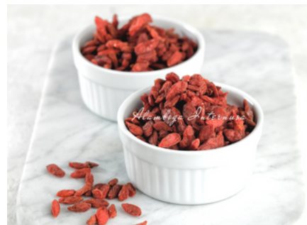
Dried Gojiberries 3 x 1 Kg, 10 Kg & 20 Kg