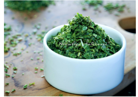
Chive Flakes 3 x 150 Gr & 10 Kg