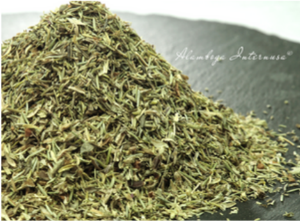
Thyme Leaves 3 x 200 Gr & 10 Kg