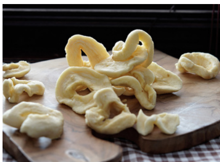
Dried Apple Rings 3 x 1 Kg