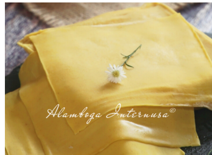
Wonton Skins 250 Gr