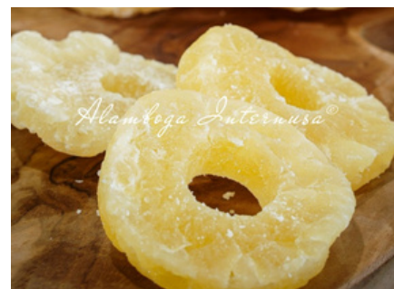
Dried Pineapple Rings 3 x 1 Kg & 20 Kg