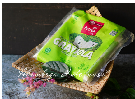
Frozen Soursop Puree 400 Gr