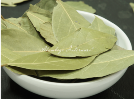
Dried Bay Leaves 3 x 100 Gr & 10 Kg