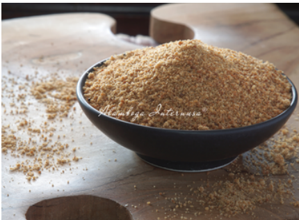
Gendismas - Coconut Palm Sugar 3 x 500 Gr