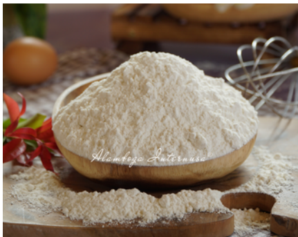
Spelt Flour 3 x 1 Kg & 12.5 Kg