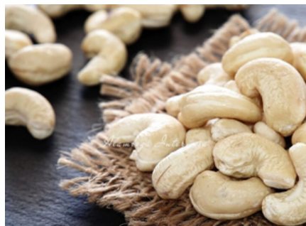
Cashew Nuts 3 x 1 Kg & 20 Kg