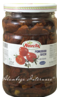
Novella - Sundried Tomatoes in Oil 6 x 1,550 ML | Glass Jar